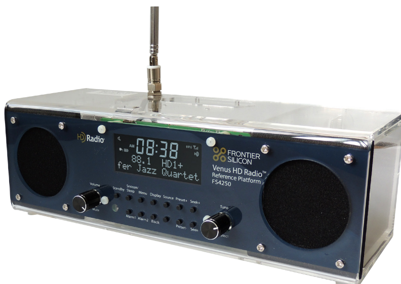
HD RADIO MODULE MOUNTED ON THE VENUS REFERENCE PLATFORM