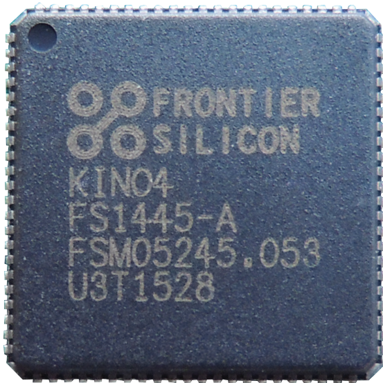
KINO 4 FULLY INTEGRATED DIGITAL RADIO CHIP