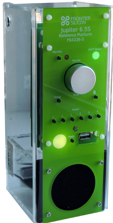
JUPITER 6.5S REFERENCE PLATFORM