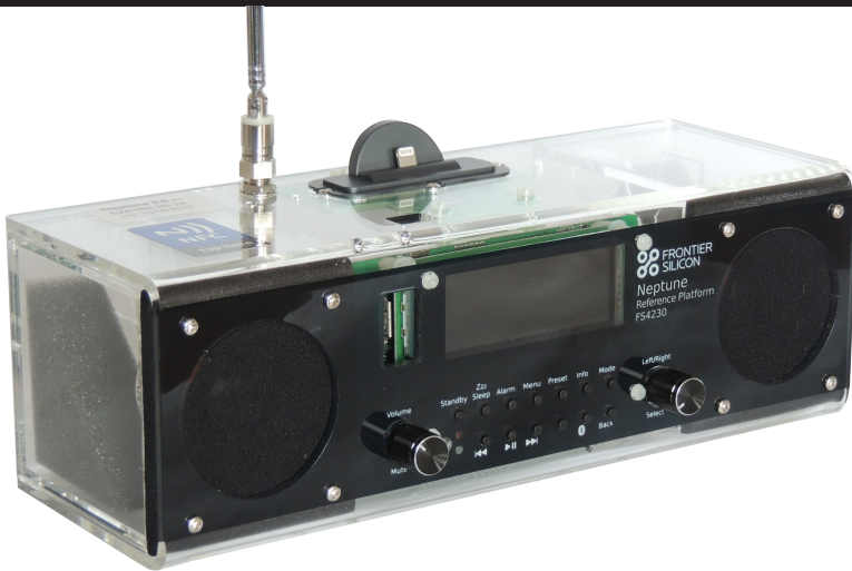
NEPTUNE REFERENCE PLATFORM