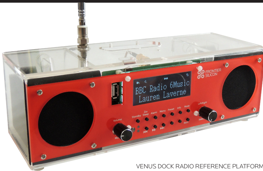
VENUS DOCK RADIO REFERENCE PLATFORM